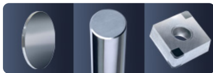
Full Wood & Metal offering