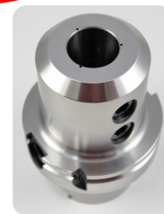
High Quality Spindle Tooling