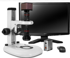
Video & Optical Measurement Systems