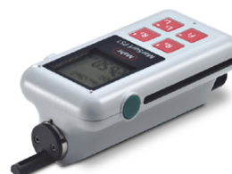
Complete metrology offering